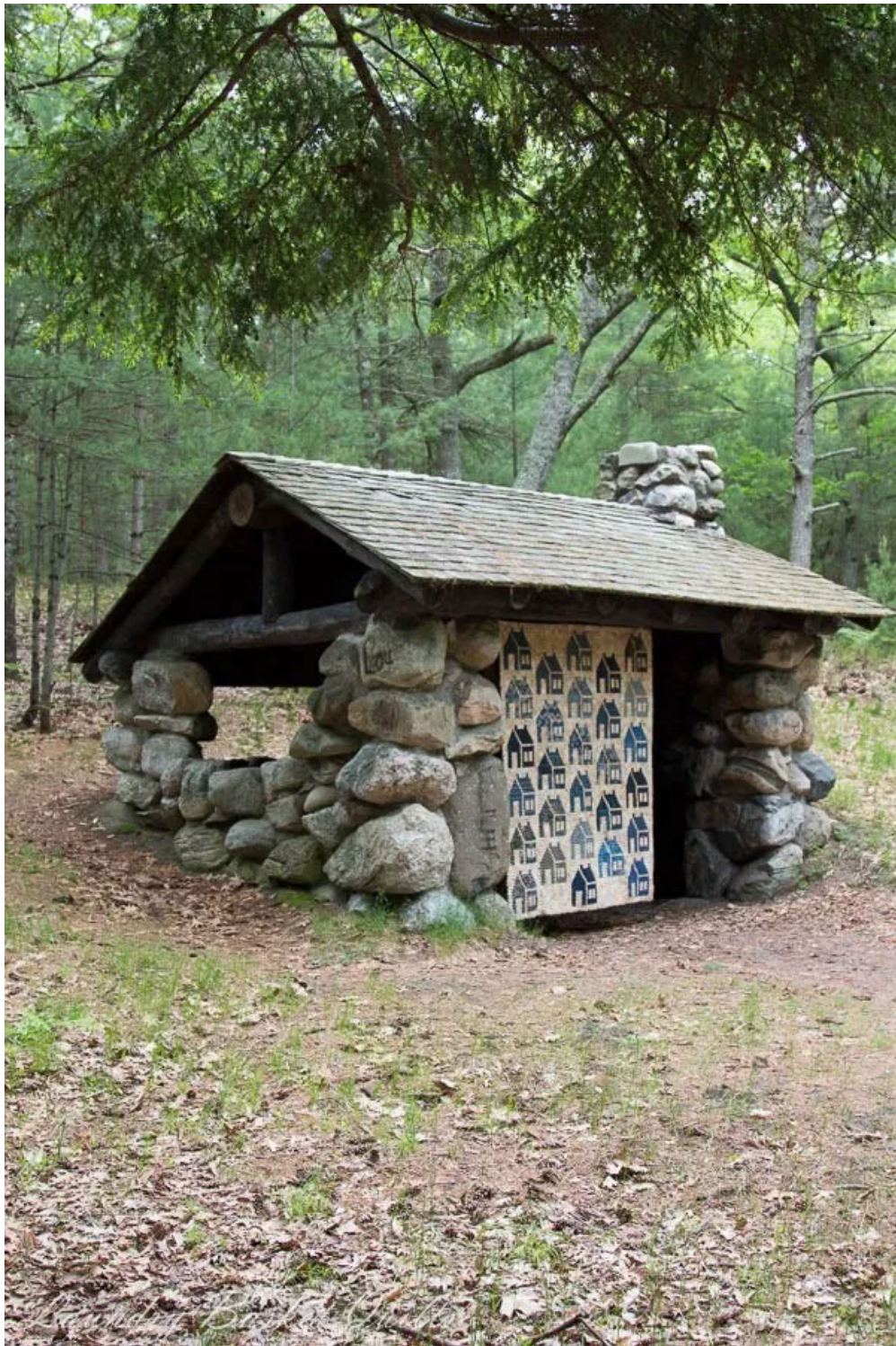
Blue Barn Quilt by Laundry Basket Quilts

Please stay home, stay safe, and I look forward to quilt with you tomorrow!