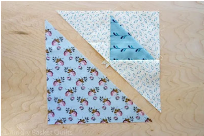
Arrange and sew large 6-7/8" half-square triangle as shown.