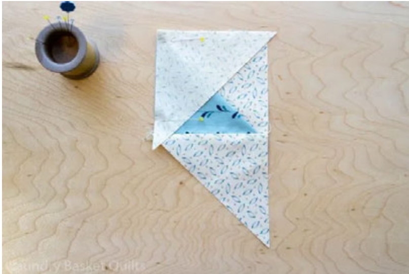
Add second 3-7/8" light half-square triangle as shown above. Remember to pin before sewing and push your seam allowances towards the light triangles.