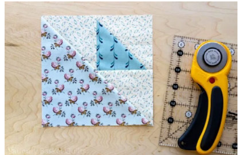
Press block open pushing your center seam allowance toward blue fabric.