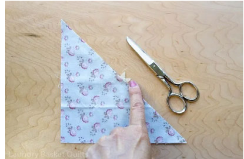
Trim the bunny ears.